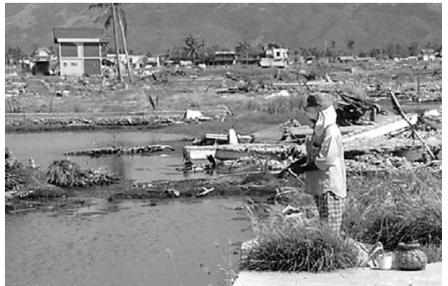
Areas of Southeast Asia hit by last December's tsunami still face great needs.

Yet, upon reflection I recognize that God is working among us throughout