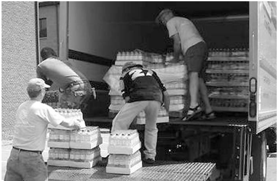
Volunteers from University Baptist in Hattiesburg and First Baptist of Rome unload water and other supplies onsite at University Baptist. Supplies were handed out to those who could come to the church, and some supplies were taken to homes of those who could not travel.