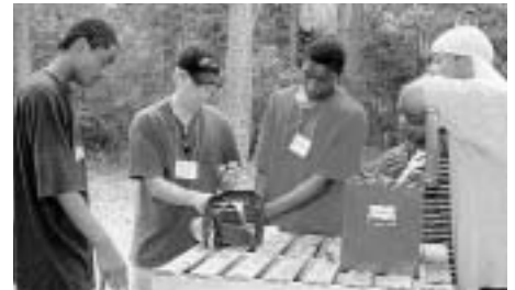
Children and young adults were eager students at "Touching Talliaferro with Love" day camp.

2002-2003 monthly budget requirement.....$46,745.50 June receipts.....$38,220.63