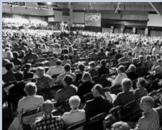
A feeling of community is nurtured during shared worship experiences at the CBF General Assembly in Birmingham, AL, June 24-26.