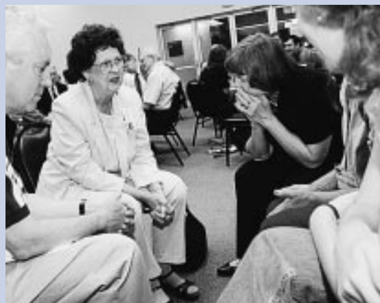
Community is also encouraged at the General Assembly through small group discussions.