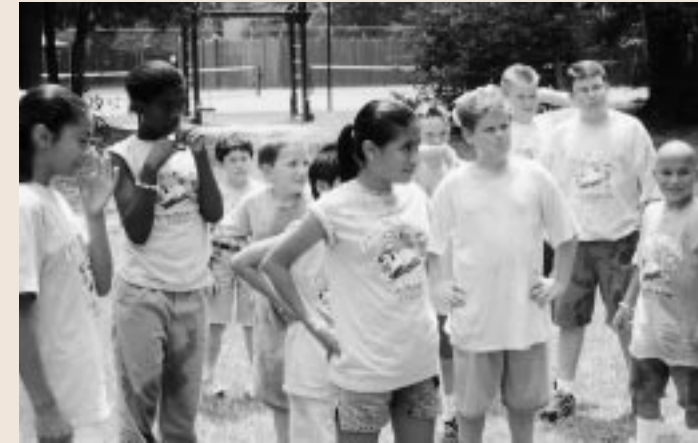
Campers listen intently to directions given by their counselor during New Horizons Camp, July 27, 1999. New Horizons Camp, near Savannah, is held annually for children who have completed grades 3-5.